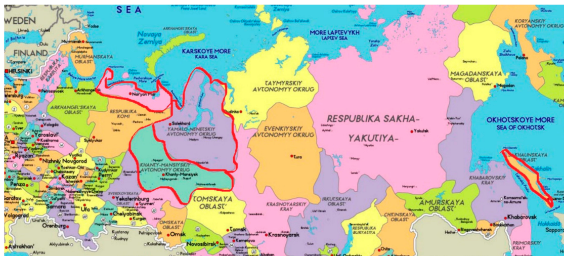
Figure 1. Administrative map of Russia.

and maintain most of the local social infrastructure, and on the other hand, they determine the social and political trends in these territories, thereby converting them into oil-dependent communities. Since tax revenues flow almost totally to the federation, the regional authorities are dependent on good relations with the companies. Based on soviet legacy, companies are expected to take care of the local infrastructure as negotiated with the regional authorities. Although this bond between the companies and the regional authorities resembles taxation, it leaves the companies a lot of power to decide the way in which they support the regions [5].