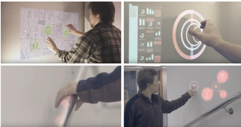
Figure 1: Screenshots from the design fiction created at the start of the Naked Approach project. Top row: information and environmental controls are accessible on demand from any wall surface. Bottom row: Bio sensors embedded into building infrastructure e.g. stair handrails with measured data being presented by the surroundings at an opportune location and time.

As the project progressed design fiction exploring more focused concepts were developed. In this stage a variety of formats were used including movie-based approaches with real actors, stop motion animation and animated graphics. In addition, many sketched comic strip format design fictions were created.