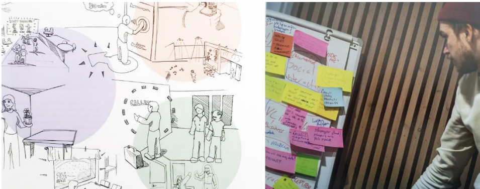
Figure 3: Evaluating the concepts using design fiction sketch materials and co-evaluation by the project team.

Reflection: The analysis process is iterative in nature. It uses e.g. collaborative workshops, participatory design with domain experts, and “Quick and Dirty” prototyping. Hence the reflection phase is an active phase throughout the whole process. In practice, data is collected, and analysed to elicit requirements throughout the entire project, e.g. from lab prototypes, and real usage environments.