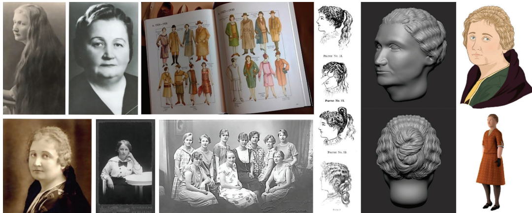
Fig. 2. Design process for character of Lyyli Perunka

accurate picture, as well as online research, background research for the game included reviewing old materials held in the town's museum and interviews with local history experts.