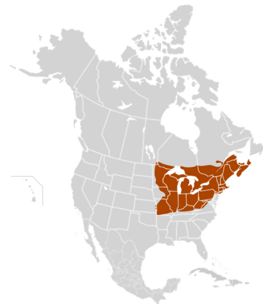
Figure 1. Regions of maple syrup production in Canada and the USA according to the Maple Syrup Producers' Association of Ontario [94].

Several authors, such as Lagacé et al. [49], have studied maple sap during different harvest periods to show variations in its organic composition: sugar (sucrose, fructose, and glucose), organics acid, and phenolic compounds. This means having to change some intrinsic factors, such as maple tree sap flowing in trunks. Moreover, other changes could modify its composition given the microbial maple sap population (fungi and total aerobics), which progressively increase during the season [9,93]. After maple sap is collected, it is contaminated by microorganisms, which are responsible for sucrose hydrolysis and the final presence of fructose and glucose in maple syrup [50].