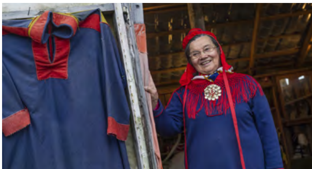
Sámi woman in traditional clothes. Magerøya Island, Finnmark, Norway.

The implementation of the CEDAW Convention is monitored by the CEDAW Committee, and each State Party is required to submit a national report to the Committee at least every 4 years outlining measures taken to fulfil the Convention's provisions. 80 Reports are not always submitted on time and two reports are sometimes joined and submitted at the same time.