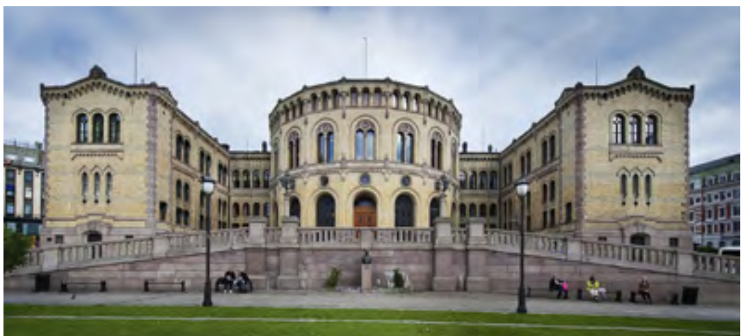
Parliament of Norway. Dmitry Valberg

Norwegian policy since 2017 is restricted to emphasising that the best guarantee of sustainable development in North Norway is a diverse labour market that allows women and men, both young and old, to participate in working life. One aim is to build local communities that can attract people of different ages and genders.