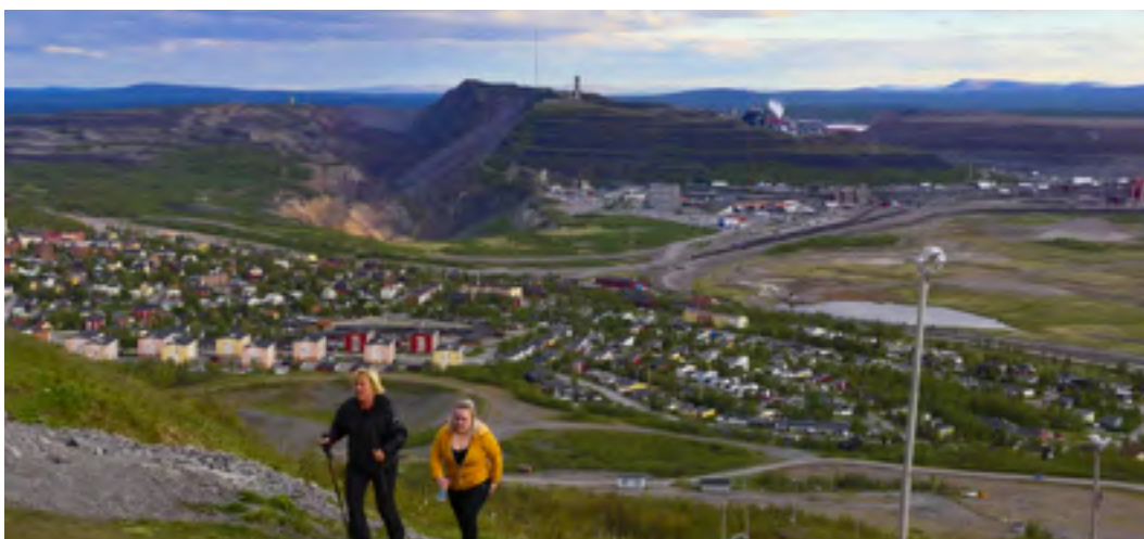
Hiking in the mining town of Kiruna, in the north of Sweden.

The preamble of CEDAW envisions a transformative approach, while demanding substantive equality (Hellum & Aasen, 2013a). All Arctic States, except for the U.S., have also ratified the Optional Protocol to CEDAW that entered into force in 2000. This declares that individuals or groups of women can submit communications in which they perceive a breach of the convention that the monitoring committee then reviews. 47