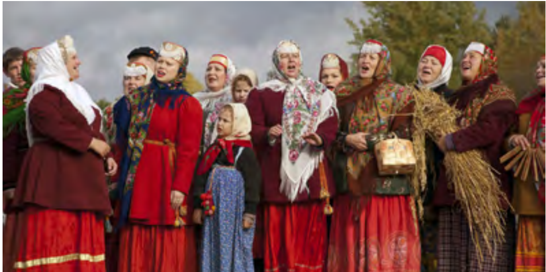
Women singing in Arkhangelsk, one of the largest cities in the Russian Arctic.

Canadian law provides protection against discrimination based on sexual orientation and gender identity/expression in addition to sex/gender. While rights are guaranteed to individuals, protected grounds such as sex relate to groups, allowing for some focus on structural and systemic discrimination rather than merely individual identity. 57 The courts for example recognise sexual harassment as a question of abuse of power rather than of femininity or masculinity. 58 The Canadian Charter leaves equality rights open ended to allow the inclusion of new groups, such as LGBTQIA2S+ people. 59 In Russia, same-sex sexual activity between consenting adults in private was decriminalised in 1993 but not declassified as a mental illness until 1999. Even today, same-sex couples and households headed by same-sex couples are ineligible for the legal protections available to opposite-sex couples.