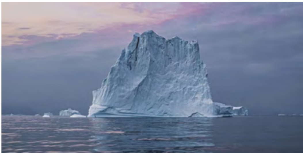
Iceberg in Scoresby Sund, East Greenland. Thomas Reissnecker

The non-discrimination principle is included in the constitutions of all the Arctic States, while the protected grounds may vary. Discrimination is however not always based on just one ground, such as sex (and/or gender). Intersectionality is a theoretical framework for understanding how a person's social and political identities combine to create different (sometimes overlapping) modes of discrimination and privileges (Crenshaw, 1989) and how different inequalities intersect, leading to complex forms of discrimination (Kantola & Nousiainen, 2009; Kriszan et al., 2012).