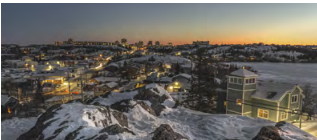
Yellowknife, capital city of Canada's Northwest Territories.

For Denmark's 9th report to the CEDAW Committee, the Greenlandic government submitted a report on gender equality in Greenland. In this report, the Greenlandic government stated that this equality act should allegedly cover "gender equality in all areas" 98 However, the act does not in fact cover all areas. It is limited primarily to situations related to the workplace. This is seen in the initial proposal discussion 99 and in the wording of the legislation, as its aim and scope is limited to promoting equality "to the extent that similar or better rights do not result from a collective agreement". 100 The combined report on gender equality by the Danish Institute of Human Rights and Greenland Council on Human Rights confirms this. 101