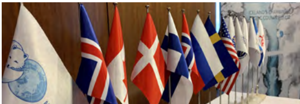
Arctic Council flags. Arctic Council Secretariat

Global integration and a rights-based approach, with its point of departure in international legal instruments, may erode the fundamental distinction between civil and common law systems. However, although global trends draw towards convergence also in the Arctic, the legal systems in this region continue to exhibit considerable diversity (Einarsson et al., 2004; Larsen & Fondahl, 2014). Institutional and legal changes at the formal level do not change traditions overnight. The rule of law is a work in progress rather than a completed project (Einarsson et al., 2004, p. 103).