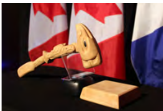
The gavel used by the Chairman of Senior Arctic Officials at Arctic Council meetings.

However, since 2013 the Council has been among the variety of supporters and cooperative partners in the Gender Equality in the Arctic Project. That project was initially submitted to the Council by MFA Iceland in cooperation with the Stefansson Arctic Institute and the Centre for Gender Equality. It aimed to promote a dialogue on gender equality in the Arctic region and to raise awareness of the situation of women and men in the Arctic. The project has resulted in a conference, a webpage presenting a wide network of researchers and other stakeholders, and a list of publications on gender equality in the Arctic. This report is a result of that project. 17