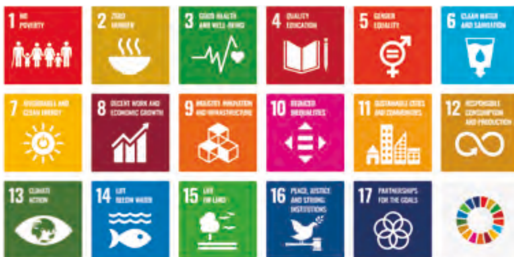
The UN Sustainable Development Goals

Arctic States and Indigenous Peoples cooperate in several intergovernmental bodies, forming the geopolitics of the Arctic. Gender equality is a primary concern for the global community, one that is firmly emphasised, at least on a rhetorical level. A common concern for gender-unequal situations is expressed in global agendas that invoke a quest for measures to eliminate that inequality. The instruments for achieving the goal vary. Some are legally binding, others are voluntary. The importance of global normative instruments should be neither overly stressed nor underestimated. Some are expected to be implemented at a national level, and there are monitoring processes that facilitate such implementation. Gender equality might have been expected to be more pronounced in the Council, but this is not borne out in the evidence, as already discussed.