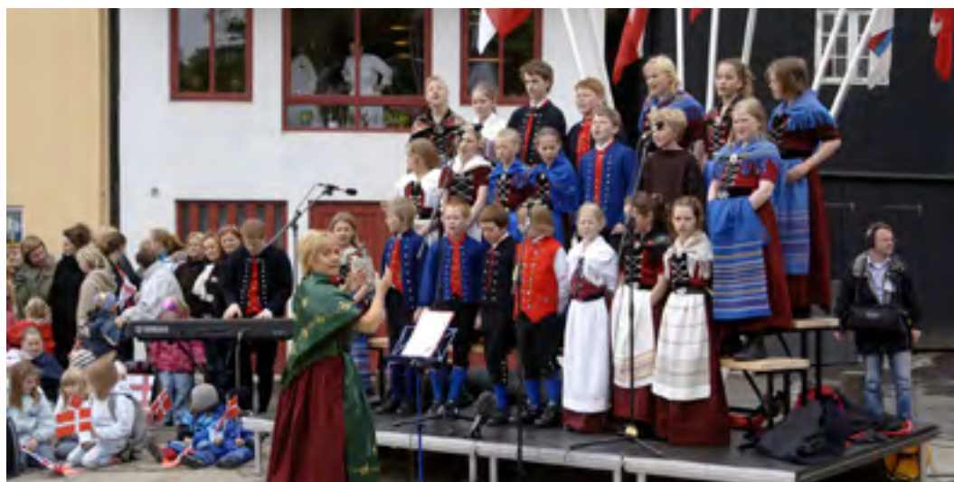
Faroese children's choir in traditional dress in Torshavn, Faroe Islands.

Act also puts much emphasis on eliminating gender stereotypes and practices that must be the focus of change to overcome structural discrimination (i.e., moving towards transformative equality). One of the explicitly expressed aims of the Act is "specifically improving the position of women and increasing their opportunities in society" (Art. 1).