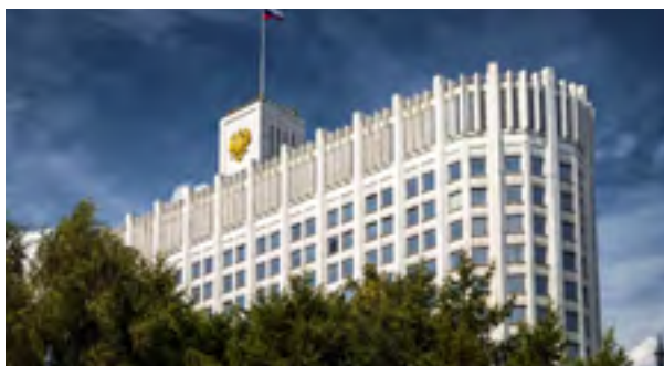
House of the Government of the Russian Federation (White House), Moscow, Russia.

Paragraph 4 of Art. 15 of the Constitution of the Russian Federation states that the generally recognised principles and norms of international law and international treaties of the Russian Federation are an integral part of its legal system and that international treaties can take precedence over ordinary Russian laws. However, the Russian Constitution takes precedence, meaning that if the Constitution conflicts with an international obligation, the Constitution will prevail.