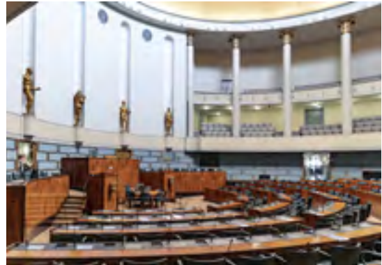
Parliament of Finland in Helsinki.

Canada refers to the United Nations 2030 Agenda for Sustainable Development as a key international commitment that informs its Arctic and Northern Policy Framework and expresses its commitment to implementing and measuring progress towards these goals. Among them is the goal to achieve gender equality and empower all women and girls. Specifically expressed are commitments to diversity and equality in policy and programming and to employing gender-based analysis to assess potential impacts on diverse groups of people. 20 One objective is to ensure that Arctic and Northern people, including youth and all genders, play a leading role in developing research and other knowledge-creation agendas. 21 Importantly, the document specifically addresses Indigenous women with the objective of addressing the systemic causes of all forms of violence against them.