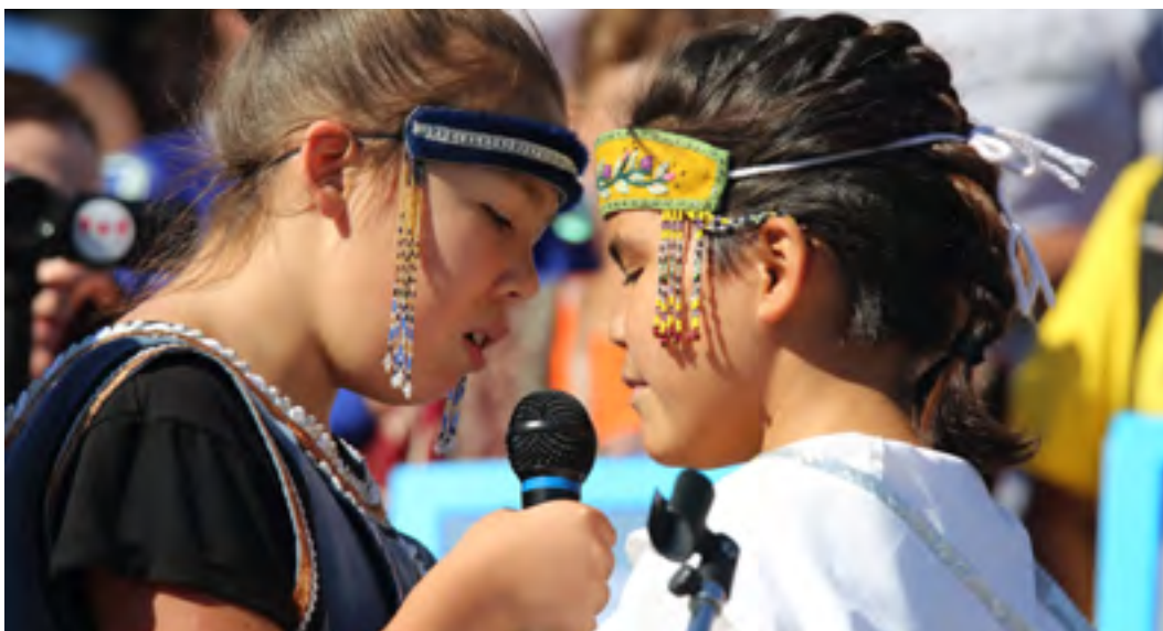
Two young Inuit throat singers perform at a vigil for missing and murdered Indigenous women.

The Committee states that some groups of women in the Arctic are vulnerable 84 , especially Indigenous and rural women, and Arctic States do not adequately uphold their rights, for example when it comes to exposure to violence, equal participation in governing bodies, and economic self-support. 85 The Committee has expressed concern about the low proportion of Sámi women in the Sámi Parliaments and in other political decision-making bodies in Finland, Norway, and Sweden. It has also identified lack of social services (also in Sámi languages) and the relatively high exposure to domestic violence that Sámi women suffer. 86 Similar concerns have been raised in Canada.