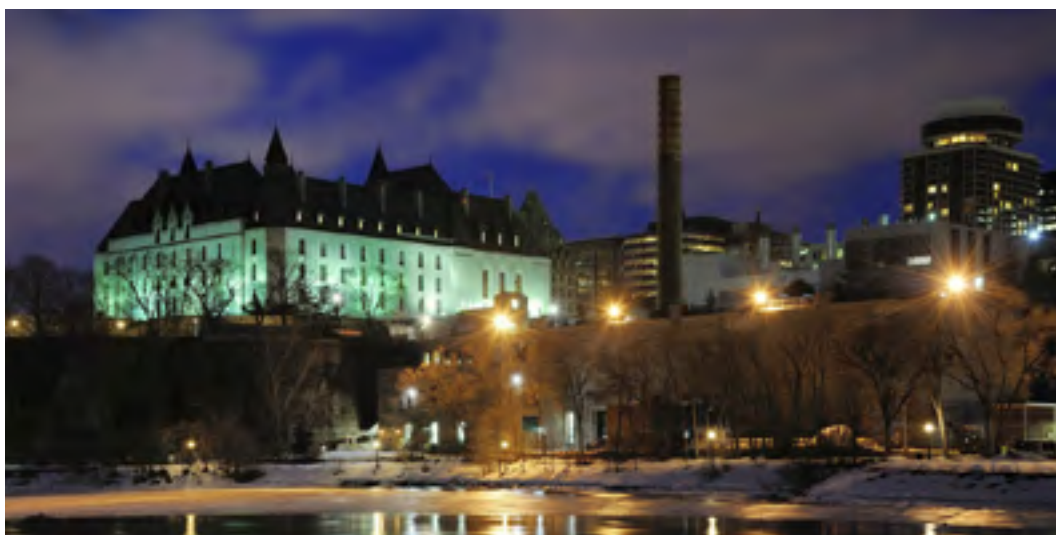
The Supreme Court of Canada Building. Saffron Blaze

guarantee of gender equality. 40 The CBR was interpreted very narrowly by the courts, as guaranteeing only formal equality. 41 The Charter has been interpreted by courts as protecting substantive equality. In two 2018 decisions, the Supreme Court of Canada recognised substantive sex equality in the context of pay equity, stating: "To provide no recourse for pay discrimination based on sex, denies substantive equality to working women, entrenching and perpetuating their pre-existing disadvantage". 42 In a 2020 decision, the Supreme Court recognised that facially neutral policies—such as those restricting benefits available to part-time workers—may also discriminate against women. 43 However, courts and human rights tribunals may also find that limits on women's equality are reasonable and justifiable in some circumstances. 44 Canadian law permits but does not require special measures (affirmative action) to promote substantive equality.