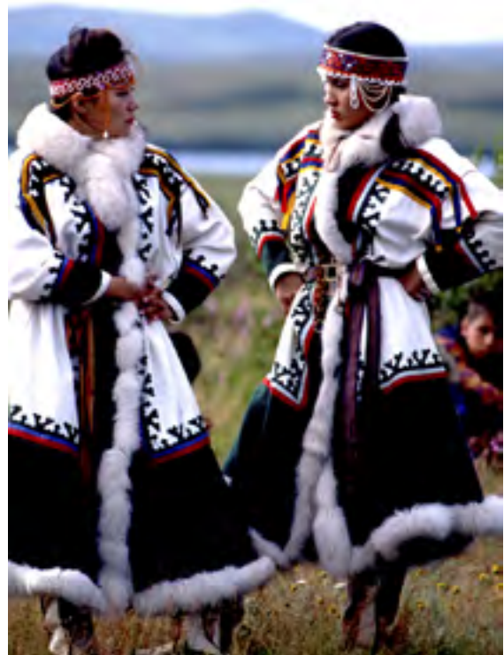
Nenets women at a dancing ceremony, Pechora Delta, Nenets Autonomous Region, Russia.

The influence of Agenda 2030 can be identified in regional and national political agendas, such as the Nordic political agenda on gender equality for 2011–2014, preceding the adoption of Agenda 2030 (Nordic Council of Ministers, 2011). In 2019, Canada published its interim 2030 Agenda National Strategy for implementing Agenda 2030 domestically, including by setting out 30 concrete federal actions to advance progress on the Agenda 2030 framework and 30 national ambitions to achieve Agenda 2030 in Canada. 65 Though the interim strategy document does not have much substantive to say about measures to advance gender equity in Canada, it does explicitly recognise that realising the full suite of 17 SDGs, and not only SDG 5, "cannot be achieved if half of humanity continues to be left behind". 66 Moreover, it states that Agenda 2030 will be implemented in Canada with "full regard for the rights of Indigenous peoples by protecting and promoting these rights", a goal that may serve to further gender equality in the Arctic. Another example is Iceland's gender equality policy, which is explicitly linked to the SDG. 67