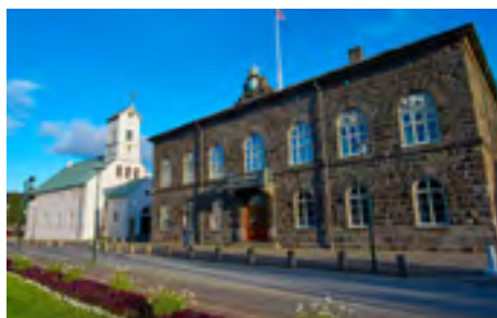
Alþingi, Icelandic parliament in Reykjavik.

Denmark (excluding Faroe Islands and Greenland), Sweden, and Finland are members of the European Union which, while not a federation, requires that members suspend some degree of sovereignty and recognise the law-making power of the EU institutions (Larsen & Fondahl, 2014, p. 100). As members of the European Economic Area (EEA), Norway and Iceland apply most EU norms, including most of the law on non-discrimination. The Arctic States have committed to follow many of the same legal instruments to a certain degree, but obligations, political cultures, and traditions differ at the national level. This leads to different levels of ambition to actively promote gender equality and equal rights for men and women.