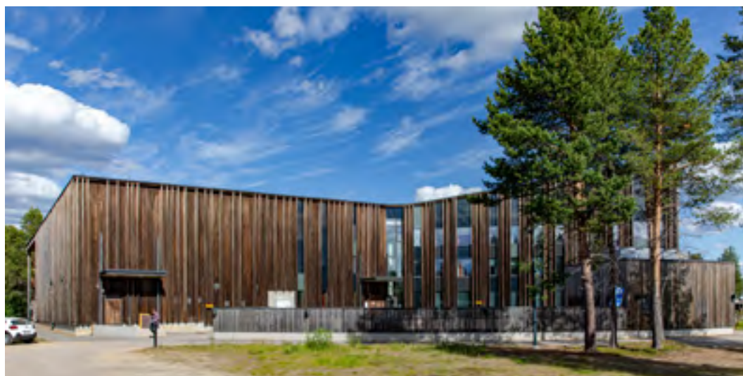
Sámi Parliament of Finland in Inari.

The Sámi policy also addresses gender roles but not in the same elaborated way as the Inuit policy. Two objectives articulated in the policy are to study all Sámi gender roles including non-heteronormative gender roles; to investigate the links to language, mental well-being, position in society, and gender role patterns; and to study Sámi gender roles and the culturally based expectations for being a strong woman and a macho man and the impacts they have on physical and mental health. The other policies do not address the theme.