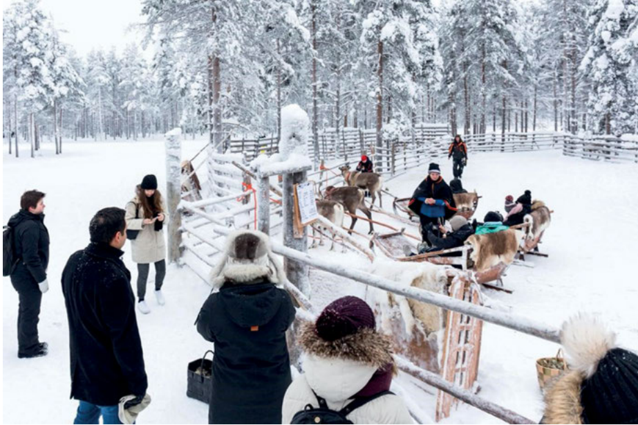
Figure 7.2: Reindeer sleigh rides at reindeer farm.

experience. Safety and winter wear is often made available to visitors, and they will have at least one experienced guide during the riding tour. Most horses used for horseback riding in Lapland are Finnhorses or Icelandic horses. The Finnhorse is a domestic horse of Finland and serves as the country's official national horse breed. Icelandic horses are also popular in tourism activities in Lapland. Both horse breeds are capable and reliable mounts, well adapted to the harsh climate and terrain of the region. As both the Finnhorses and Icelandic horses grow a thick winter coat, they can tolerate surprisingly low temperatures. The horses usually work in trail riding of different lengths from one hour to a half day or entire day. Some companies also offer longer trail rides which include overnight stays in cabins along the trails. The horse stables in Lapland have between five and 20 horses. Although stalls are common practice, the number of loose stables is growing in Lapland (Figure 7.3). A loose stable allows horses to live in a herd and move freely both outdoors and indoors. As with the huskies and reindeer, the work shifts of horses are monitored and the individual character and strength of horses is considered in shift planning by the human caretakers (Kähkönen, 2018).