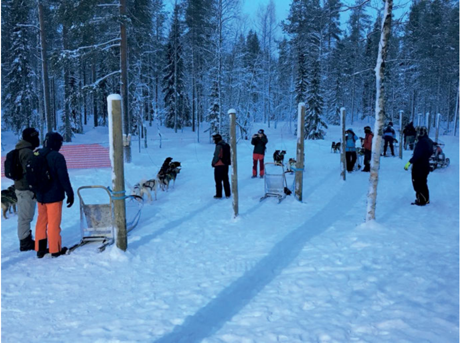
Figure 7.1: Preparing for the start of the sled dog safari.

follow a predetermined track (Figure 7.2). In case of longer tours, a guide will drive in front of all sleighs, leading and setting the pace of the tour. Reindeer tours may last from half an hour to a couple of hours. Female reindeer are not used as draft animals due to the gestation period that takes place during the winter season. Reindeer only pull sleighs during the winter season from December to April, and most of the tourism reindeer roam free in the pastures and forest of Lapland in the summer. A small number of reindeer stay at the reindeer farm during the summer months for tourist “meet and greets.” As part of the reindeer herding annual cycle, female and unskilled male reindeer are slaughtered for human consumption as in poronkäristsys (traditional sautéed reindeer) and their bones, antlers, hides, and other body parts used to produce traditional tourist souvenirs, (see García-Rosell & Hancock, forthcoming; Hoarau-Heemstra, 2018).