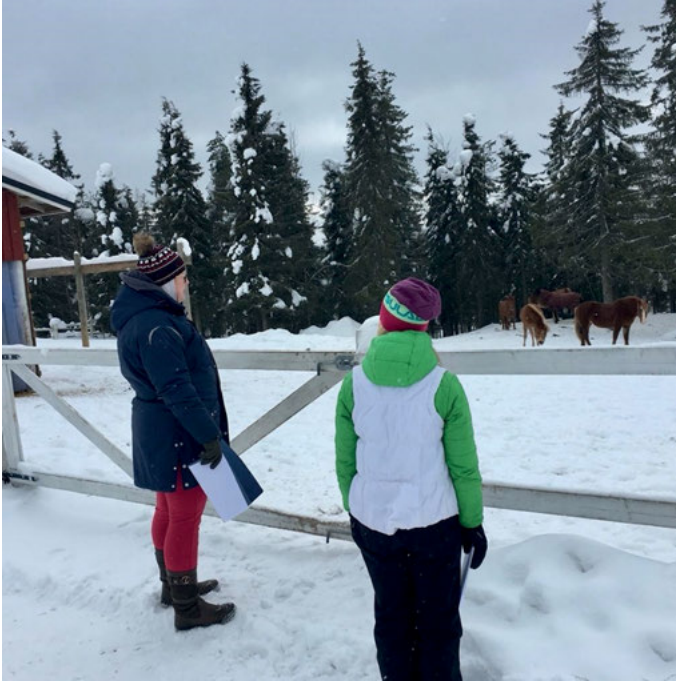
Figure 7.3: Loose stable at horse farm.